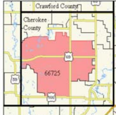
ZIP codes within the Columbus Health Area.