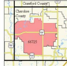
ZIP codes within the Columbus Health Area.