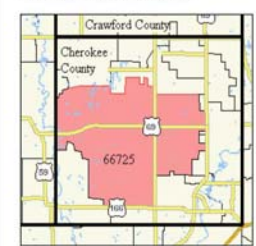
ZIP codes within the Columbus Health Area.