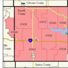
ZIP codes within the Russell County Health Area.