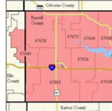
ZIP codes within the Russell County Health Area.