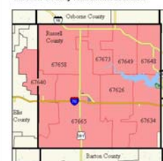
ZIP codes within the Russell County Health Area.