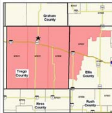
ZIP codes within the Trego County Health Area.