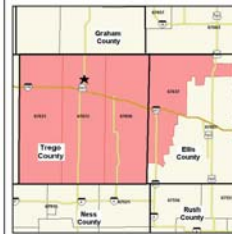
ZIP codes within the Trego County Health Area.