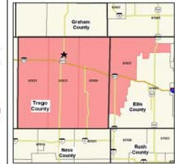
ZIP codes within the Trego County Health Area.